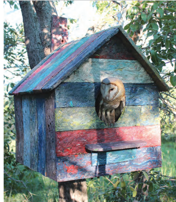
▲ An owl house made from recycled plastic

The Owl 1 _____ Centre is a nonprofit organization in South Africa that is dedicated to the protection of owls. It has also been doing incredible work for the environment. In 2018, the center started a project to collect used plastic bottles and 2 _____ them into owl houses. Plastic bottles are an increasingly 3 _____ sight in our rivers and oceans. By reusing these plastic bottles, the center can build more nesting boxes for owls and also ensure that less plastic ends up in the ocean. The project has been a 4 _____ success, and the center is now raising money to buy a ship that will collect plastic directly from the ocean.