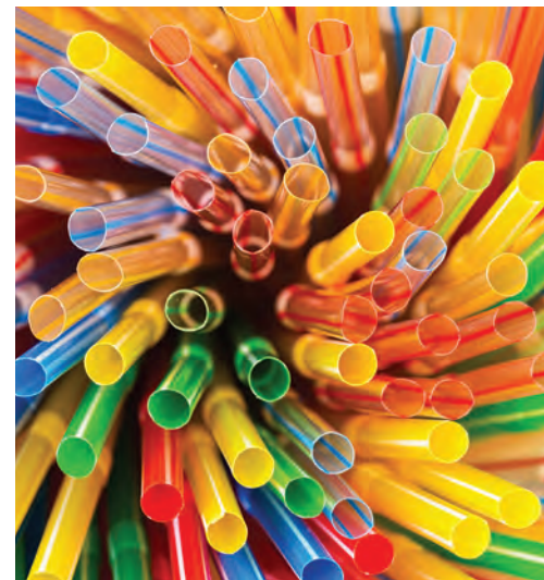
^ Single-use plastics have become a major global concern. In 2018, Collins Dictionary named "single-use" as its Word of the Year.